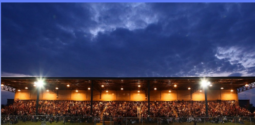
View of the New Grandstand

Snowmobile races, rodeos, auctions, derbies, monster truck shows,